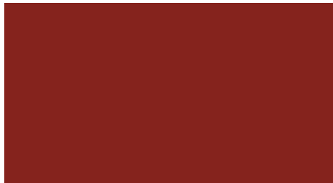
Brick Red †